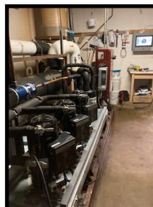
And in with the new