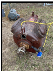
Out with the old

November 2021, an email went out to the entire membership with the news that we needed to raise approximately $65,000 to replace the club compressor. Thanks to the amazing efforts of our membership we met that goal. The new compressor was installed at the end of the season and is working great. The new system is a 3 phase system that will eliminate the risk of a compressor failure. The system is electronically controlled and will give more consistent ice temperatures thereby improving our ice surface.